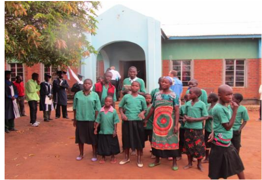
One of the 3 choirs that sang

Please pray for these men and woman as they take the good news of Jesus to their villages and surrounding areas.