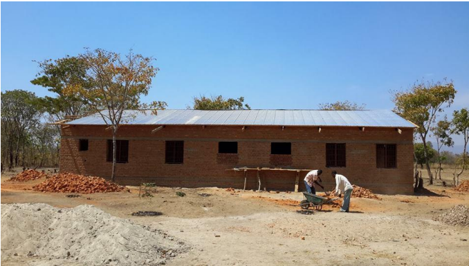
Back side of clinic