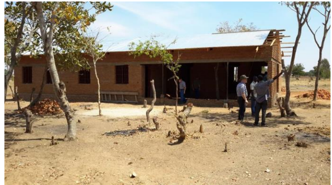
Front side of clinic

This clinic will be life-saving to many individuals. We will build two staff houses for doctors, which the government promised to supply along with an ambulance, and medicine for the clinic.